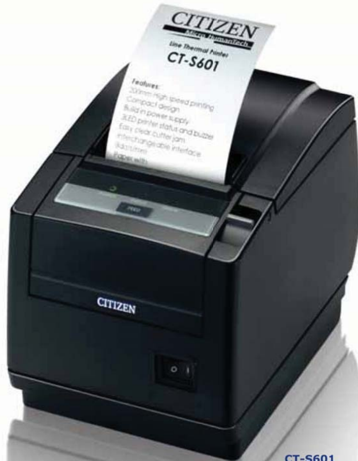
CT-S601 (available in black or white)