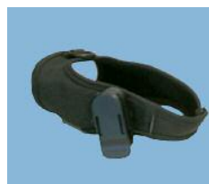
PC-8000 Protective Case/Belt Holster Allows the reader to be worn on a belt.