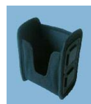
HLS-8000 Universal Holster Can be attached to desktops, work-tables, forklift trucks, etc.