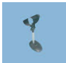
STD-8000 Hands-free Stand Allows use of the reader in hands-free mode.