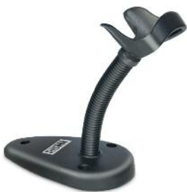
STD-QD20-BK: Hands-free Stand Allows use of the reader in hands-free mode. Also available in white.