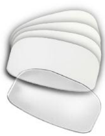
11-0318: Replacement Window 5 pack Allows the user to replace a damaged window without sending the scanner in for repairs.