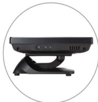
Flat Folded Mode