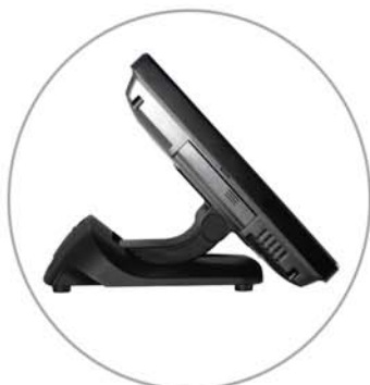
Low Profile Mode