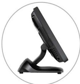
Full Extended Mode

The XT-5317 provides the selection of two foldable bases, the curvy slim GEN7E base and the larger but practical GEN8E base. The foldable base can be configured into "Flat Folded Mode" to save the shipping package volume, "Low Profile Mode" to allow greater interaction between the cashier and the customer, and the traditional "Full Extended Mode". All this can be achieved with a simple pull of the hidden lever.