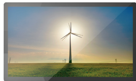
VIVID COLOUR PORTRAIT AND LANDSCAPE VIEW SUPPORT 100 X 100 MM VESA MOUNT