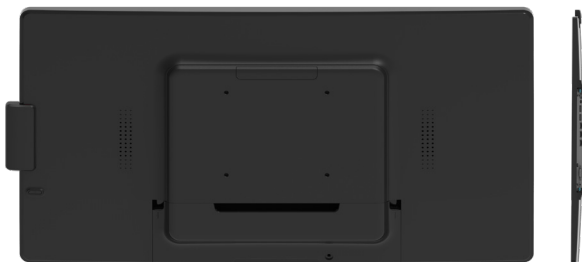
SLIM, DURABLE DESIGN

With a sleek, slim design (37.9mm width) the M22-FHD digital display is capable of multi roles such as Kitchen Video System (KVS), Self-Check In and Self-Check Out, Self Service Terminals (Self Ordering), or act as Digital Signage Display / Information Display.